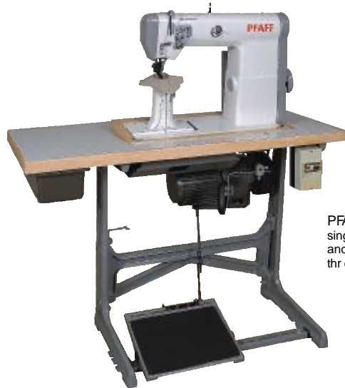
PFAFF 491-755/13-900/53 single-needle postbed sewing machine with wheel and needle feed and driven roller presser-755, with thread-trimmer -900.