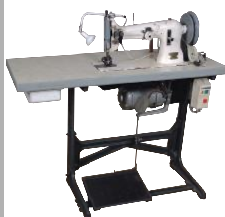
PFAFF 38-45/12 two-needle flatbed sewing machine with extra large beakshuttle, with double roller presser, for cording seams.