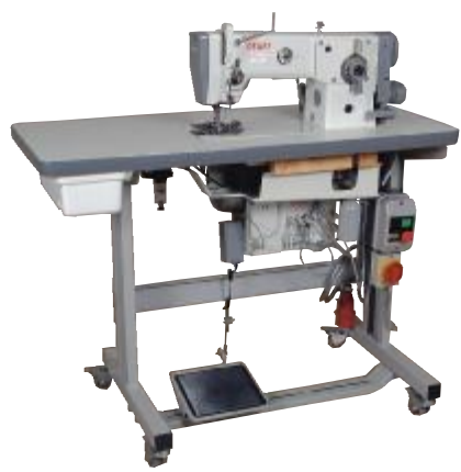
PFAFF 918-6/01-900/51 special highspeed zigzag sewing machine with large horizontal hook, with max. stitch width 10 mm, max. stitch-length 4,5 mm, thread-trimmer -900.