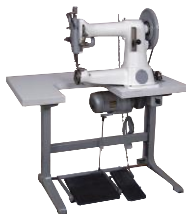
Adler 105-MO 25 single-needle heavy-duty barrel-shuttle arm-type sewing machine with special guide for making Moccasin-beads.