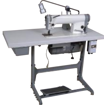
PFAFF 483-944/01-900/51 single-needle highspeed flatbed sewing machine with drop feed, with roller presser -944, with thread-trimmer -900.